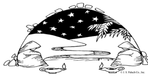
— Mark 13:33

Be watchful! Be alert! You do not know when the time will come.